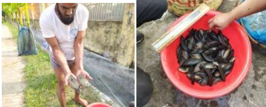
Fig 3: Pictorial view of Vietnamese koi ( Anabas testudineus )