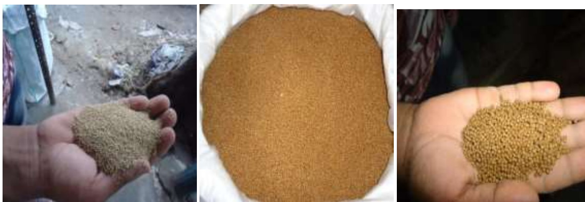
Fig 2: Pictorial view of feed that applied in study area

After stocking, in order to meet up the increasing dietary demand, commercial fish feed named Nourish Feed (Nursery-2 to Grower) containing average 30% crude protein were applied as supplementary feed at the rate of 3-10% of standing biomass of fish twice daily.