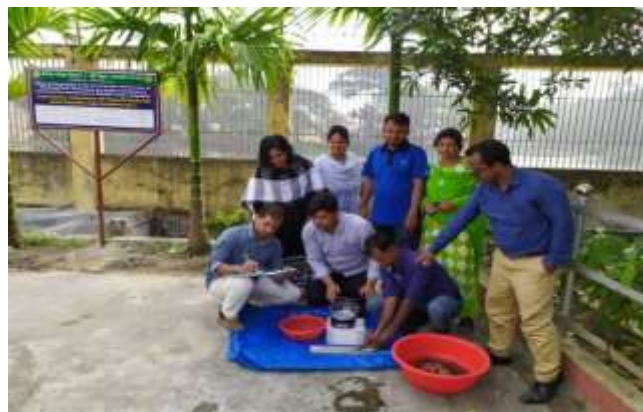
Fig 1: Pictorial view of sampling for Vietnamese koi ( Anabas testudineus )

Random sample of ten fishes from each dewatering canal was sampled fortnightly by using a scoop net. The total weight was measured by using a portable electronic balance (Tanita, Japan).